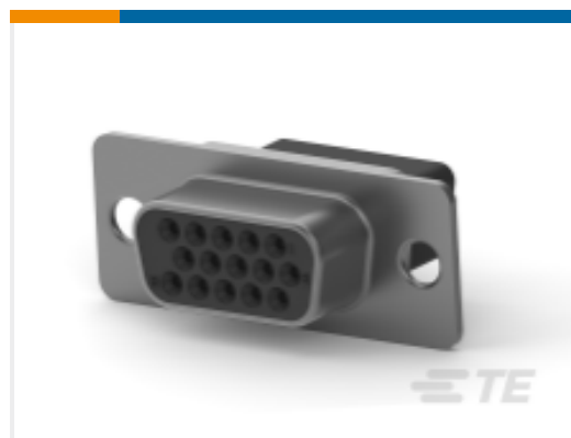
TE Part # 216164-1 15P.HDP22 REC.ASSY.