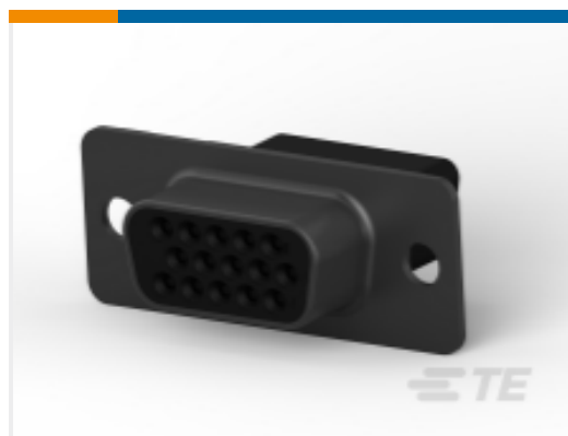
TE Part # CAT-038-DCRSS221 D-Sub Crimp Recept Signal 15 Posn, Socket Size 22, Shell Size 1