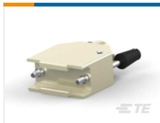
TE Part # 2198617-9 Ni Plated Plastic Backshell, 9 Way, Str