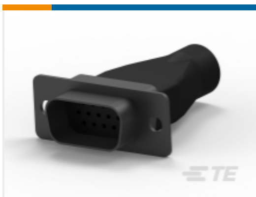
TE Part # CAT-038-DCPPS221 D-Sub Crimp: Plug, Signal, 50 Posn, Pin Size 22, Shell Size 1